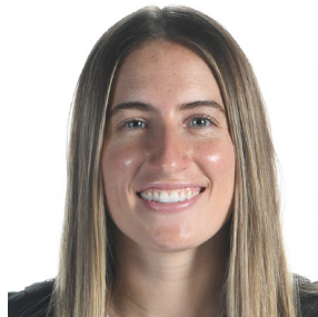
#20 Kate Martin 6-0 | Guard | 2nd Season