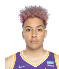
#25 Layshia Clarendon Guard {Lay-shuh Clare-in-din}