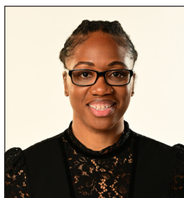
Tanisha Wright Head Coach | 3 rd Year tuh-NEE-shuh