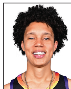
42 Brittney Griner