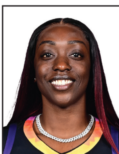
2 Kahleah Copper