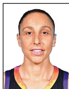
3 Diana Taurasi