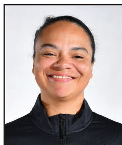
Associate Head Coach Kristi Toliver