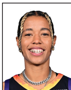
0 Natasha Cloud