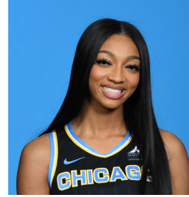
ANGEL REESE #5 | F | 6'3"