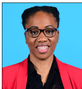
Tanisha Wright Head Coach | 2 nd Year luh-NEE-shuh