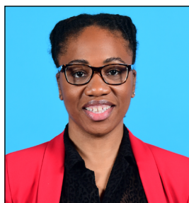
Tanisha Wright Head Coach | 2 nd Year tuh-NEE-shuh