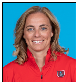
Nicki Collen Head Coach @NickiCollen