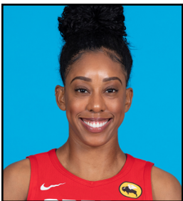
25 Monique Billings F · 6-4 · 192 @moniquebillings