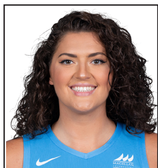
STEFANIE DOLSON CENTER 31