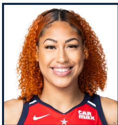
#0 SHAKIRA AUSTIN CENTER