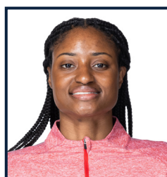
LATOYA SANDERS ASSOCIATE HEAD COACH