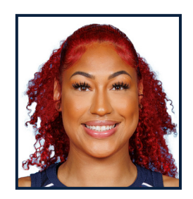
#0 SHAKIRA AUSTIN CENTER