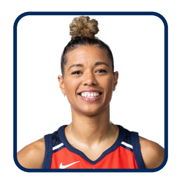
#9 NATASHA CLOUD GUARD