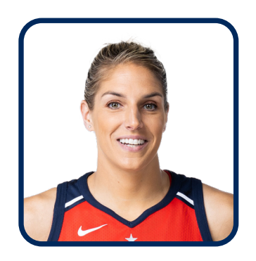
#11 ELENA DELLE DONNE GUARD/FORWARD