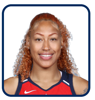
#0 SHAKIRA AUSTIN CENTER