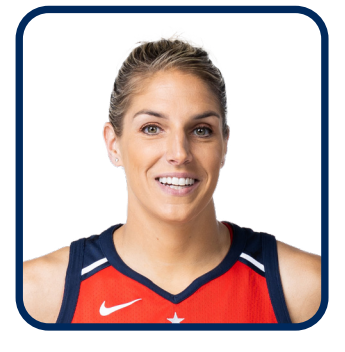
#11 ELENA DELLE DONNE GUARD/FORWARD