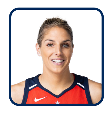
#11 ELENA DELLE DONNE GUARD/FORWARD