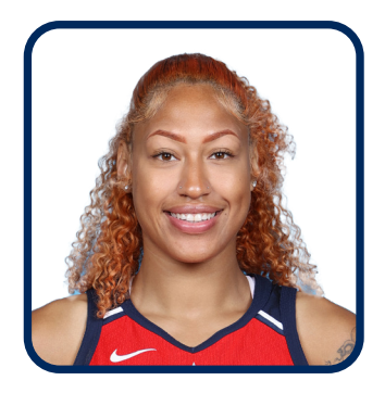
#0 SHAKIRA AUSTIN CENTER