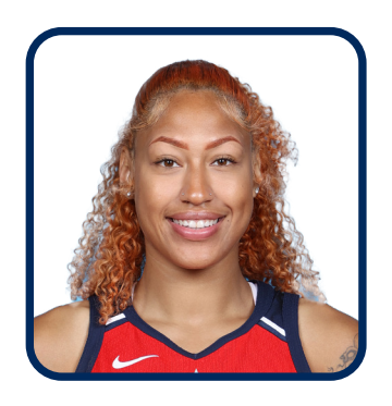
#0 SHAKIRA AUSTIN CENTER