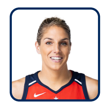
#11 ELENA DELLE DONNE GUARD/FORWARD