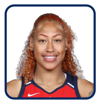
#0 SHAKIRA AUSTIN CENTER