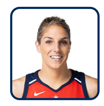
#11 ELENA DELLE DONNE GUARD/FORWARD