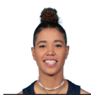
#9 NATASHA CLOUD