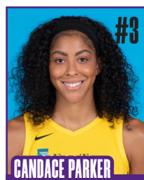
CANDACE PARKER Position: F/C Height: 6'4" DOB: 4/19/86 College: Tennessee