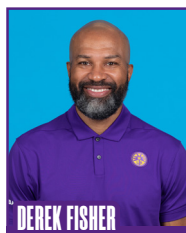
DEREK FISHER HEAD COACH