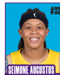
SEIMONE AUGUSTUS Position: G/F Height: 6'0" DOB: 4/30/84 College: LSU