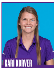
KARI KORVER ASSISTANT COACH