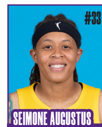
SEIMONE AUGUSTUS Position: G/F Height: 6'0" DOB: 4/30/84 College: LSU