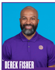
DEREK FISHER HEAD COACH