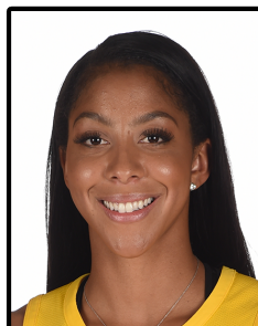
#3 CANDACE PARKER