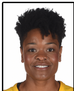
#0 ALANA BEARD