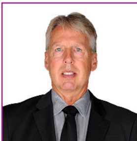
Brian Agler Head Coach