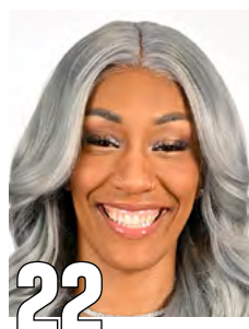
22 A'JA WILSON Center | 6-4 | 195 South Carolina | 7th Year