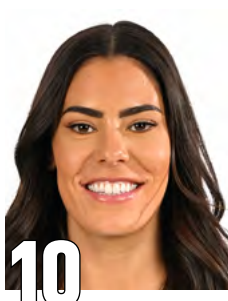
10 KELSEY PLUM Guard | 5-8 | 145 Washington | 7th Year