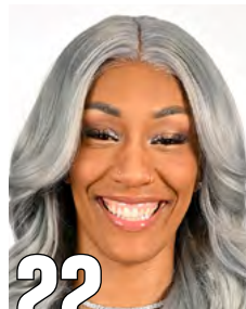
A'JA WILSON Center | 6-4 | 195 South Carolina | 7th Year