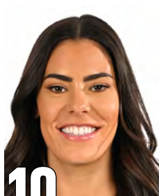
10 KELSEY PLUM Guard | 5-8 | 145 Washington | 7th Year