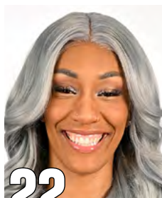
22 A'JA WILSON Center | 6-4 | 195 South Carolina | 7th Year