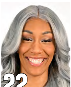
A'JA WILSON Center | 6-4 | 195 South Carolina | 7th Year