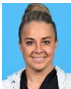
BECKY HAMMON Head Coach