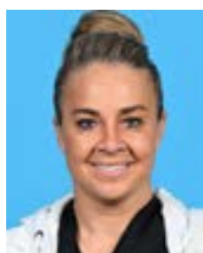
Becky Hammon Head Coach