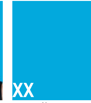
Name Pos Ht Wt College Years