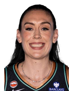
Breanna Stewart #30 (bree-ANN-uh [NOT bree-ON-uh])