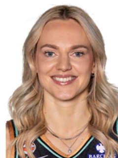
Marine Johannès #23