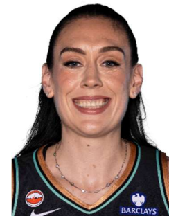
Breanna Stewart #30 (bree-ANN-uh [NOT bree-ON-uh])