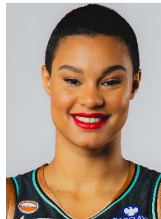
Satou Sabally #0 (SAH-too SAHbuh-lee)