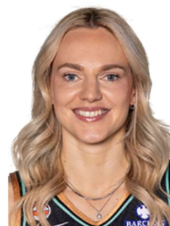
Marine Johannès #23