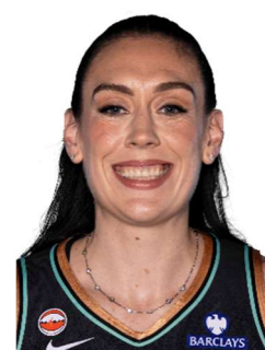
Breanna Stewart #30 (bree-ANN-uh [NOT bree-ON-uh])