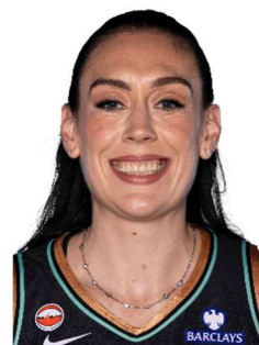
Breanna Stewart #30 (bree-ANN-uh [NOT bree- ON-uh])