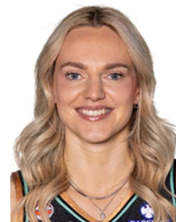
Marine Johannès #23