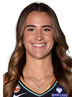
Sabrina Ionescu #20 (YO-ness-coo)