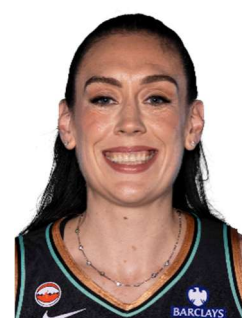
Breanna Stewart #30 (bree-ANN-uh [NOT bree-ON-uh])