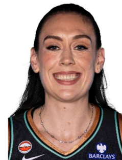
Breanna Stewart #30 (bree-ANN-uh [NOT bree- ON-uh])