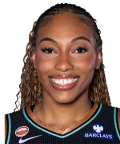
Betnijah Laney-Hamilton #44 (buh-NYE-juh Lay-knee)