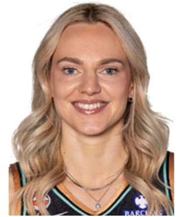
Marine Johannès #23