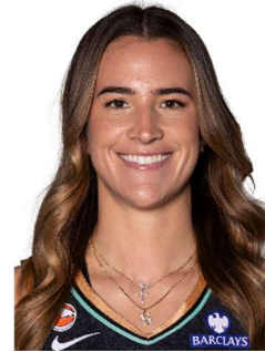
Sabrina Ionescu #20 (YO-ness-coo)