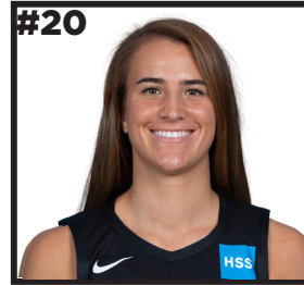
SABRINA IONESCU GUARD OREGON