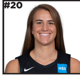
SABRINA IONESCU GUARD OREGON