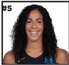
KIA NURSE GUARD CONNECTICUT