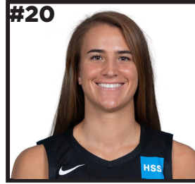
SABRINA IONESCU GUARD OREGON