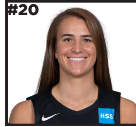
SABRINA IONESCU GUARD OREGON