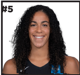
KIA NURSE GUARD CONNECTICUT