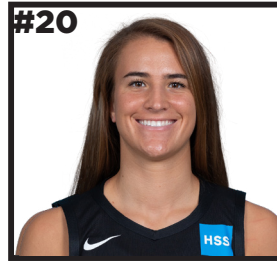
SABRINA IONESCU GUARD OREGON