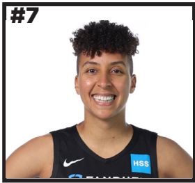
LAYSHIA CLARENDON GUARD CALIFORNIA