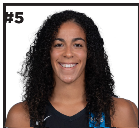
KIA NURSE GUARD CONNECTICUT