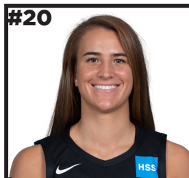
SABRINA IONESCU GUARD OREGON