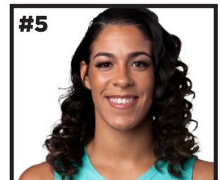
KIA NURSE GUARD UConn