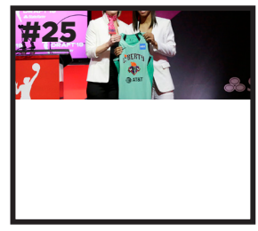
ASIA DURR GUARD