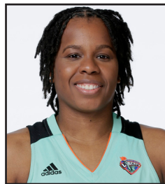
#10 EPIHANNY PRINCE GUARD 9TH SEASON