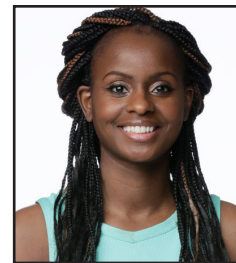
#14 SUGAR RODGERS GUARD 6TH SEASON