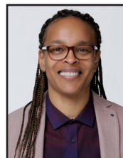
DIR. PLAYER DEVELOPMENT TERESA WEATHERSPOON 4TH SEASON