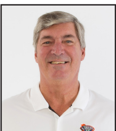
BILL LAIMBEER HEAD COACH 5TH SEASON