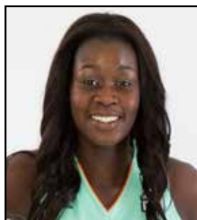
#2 ADUT BULGAK CENTER FIRST SEASON