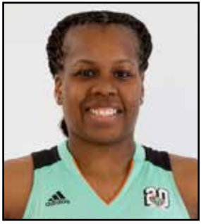
#10 EPIPHANNY PRINCE GUARD SEVENTH SEASON