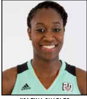
#31 TINA CHARLES FORWARD/CENTER SEVENTH SEASON